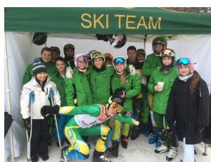
The NDP Girls Varsity Ski team celebrates its 2015 Regional Title