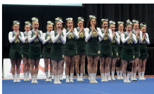
NDP led from start to finish in the Division III competitive cheer state finals